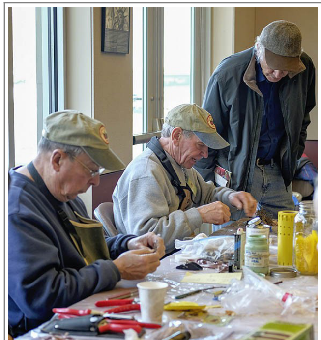
Bench grafting at a past Winter Field Day

Shipova Asian Pear Atago Chojuro Hamese Ichiban Nashi Mishirasu Shinseiki Yakumo