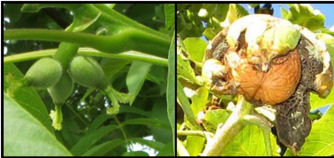
Walnut in April and September

comparisons of Cherry trees grown Tatura trellis, Horizontal Tee espaliers, Fan espalier, UFO espalier (on 3 different rootstocks), and the new Tart Cherry trial.