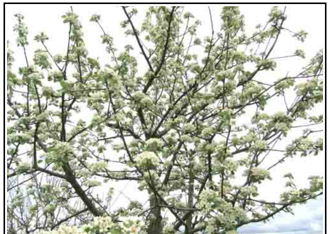
The shipova tree in early April