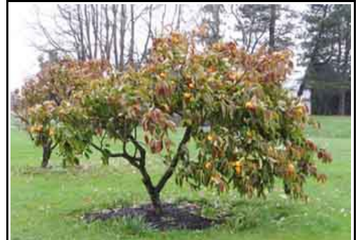
Persimmons in late October

Beginning at the first sign, which is located at the east Kiosk, a tri-fold map takes visitors on a 45 minute self guided tour of the various Points of Interest which exhibit both popular and unusual varieties, as well as displaying various training methods. For instance, Honeycrisp apples are being grown as Slender Spindle, Vertical Cordon espaliers, Horizontal Tee espaliers (on 3 different rootstocks), Belgian Fence espalier, and the giant WELCOME sign espalier. Also, there are