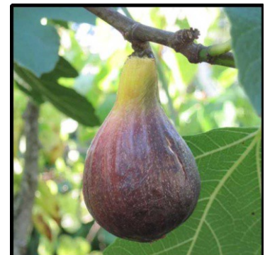
Figs do not ripen off the tree

Brown Turkey Contessina Neveralla Desert King