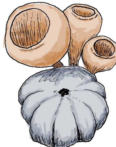
Blueberry mummy with apotheca

Raking the surface of the soil around the blueberry plants disturbs the apotheca. After raking mulching with about 2 inches of Douglas fir sawdust also helps reduce the number of apotheca.