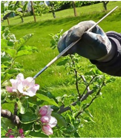
Pollen applied to "king bud."

What we are conducting is an experiment using some of the apple trees growing in the Fruit Garden to check for the effectiveness of various applications of this commercial pollen mix for homeowners without beehives. We have 4 different application criteria on 2 different varieties of apples, using 2 different culture growing techniques: (1) Karmijn de Sonnaville grown using regular dwarf fruit tree culture, and Honeycrisp as an Espalier. On both sets of trees the Fruit Garden Volunteers (thank you all!) applied a commercial mix of Granny Smith pollen (selected as an ideal cross-pollinator for Honeycrisp and hopefully an effective cross-pollinator for Karmijn de Sonnaville) and the pollen enhancer "SureSet".