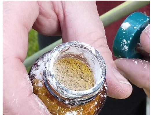
Mixed "puffer" container of Sureset Apex "pollen enhancer" and a specific pollen to cross-pollinate Honeycrisp apples.

Beyond the control trees, which we did nothing to, we applied the pollen/SureSet mix by hand with thin, artist type paint brushes to the "king bud" (the middle bud in a cluster) on certain trees (see photo to left), then to ALL of the flower buds on another group of trees, and finally we used a "Pollen Puffer", forcing air (via it's built-in squeeze bulb at the base of a 7 foot long shaft with an inner air tube